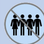
Human Rights Violations