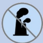
Coal Mining & Extraction